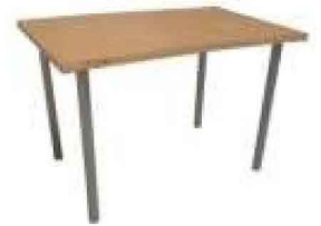
Meeting table Code: TF-02 1200(L)X900(W)X760(H)