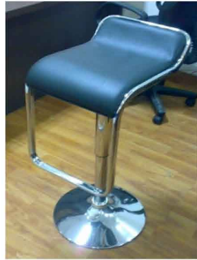
Barstool Code: BF-02 420(W)X400(D)X820(H)