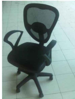
Office Chair Code: CF-10 650(W)X550(D)X800(H)