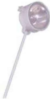
150W long arm helogen Code: LE-02