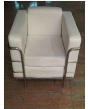
Sofa Chair with arm Code: SF-01 800(W)X750(D)X780(H)