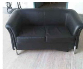
Vegas sofa double Code: LF-02 1290(W)X440(D)X800(H)