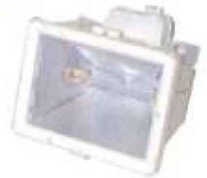
300W helogen flood light Code: LE-07