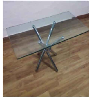
Coffee table Code: TF-01 450(W)X350(D)