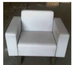
Sofa Code: LF-03 800(W)X750(D)X750(H)