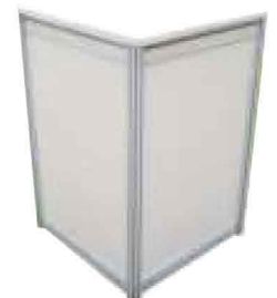
Display cube Code: PX-06 535(L)X535(W)X760(H)