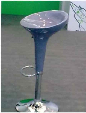
Barstool Code: BF-01 440(W)X480(D)X820(H)