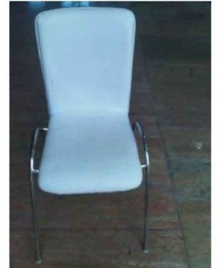
Leather Chair Code: CF-08 450(W)X450(D)X800(H)