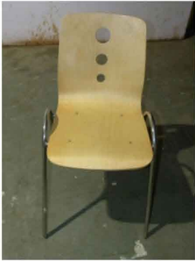
Wooden Chair Code: CF-03 440(W)X480(D)X820(H)