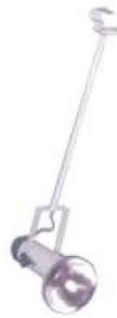
100w long arm sport light Code: le-03