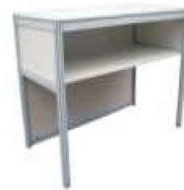
Information counter Code: PX-01 1030(L)X535(W)X760(H)