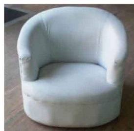
Vegas sofa single Code: LF-01 760(W)X440(D)X750(H)