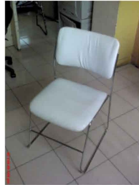
Standard Chair Code: CF-07 460(W) X 460(D)