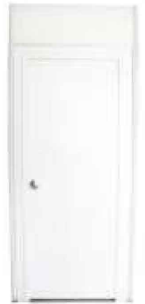
Lockable door Code: AS-03 1000(L)X2440(H)