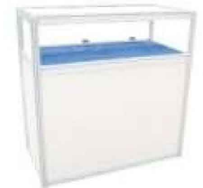
Small showcase Code: PX-02 1030(L)X535(W)X1030(H)