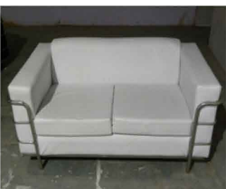
Sofa Chair with arm double Code: SF-02 1700(W)X750(D)X780(H)