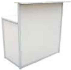
2-tier information counter Code: PX-07 1030(L)X535(W)X1030(H)