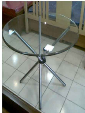
Round table Code: TR-01 850(D)X760(H)