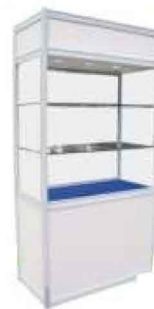
Tall showcase Code: PX-05 1030(L)X535(W)X2000(H)