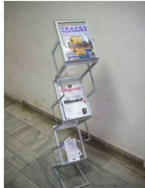
Brochure rack Code: AF-01 300(L)X300(W)X1100(H)