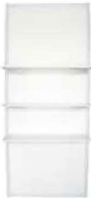
Shelf flat/ sloping Code: DS-01 1000(L)X300(W)