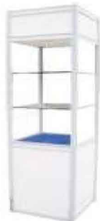
Slim showcase Code: PX-04 535(L)X535(W)X2000(H)