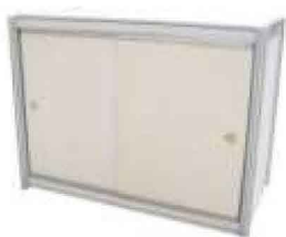
Lockable cupboard Code: PX-03 1030(L)X535(W)X760(H)