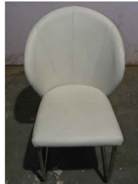
Barcelona Chair Code: CF-11 600(W)X550(D)X760(H)