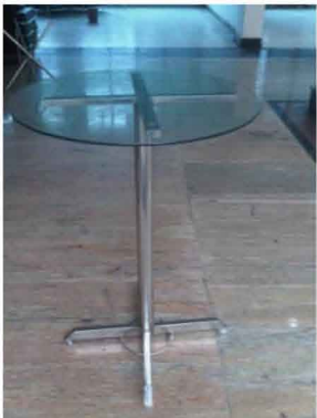
Cocktail table Code: TF-04 600(D)X1075(H)