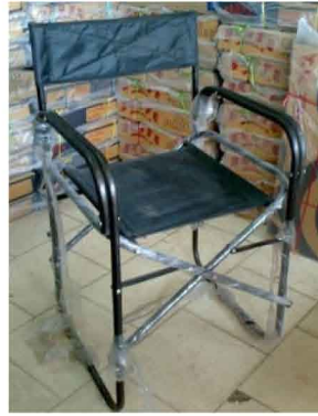
Folding Chair Code: CF-05 450(W)X460(D)X760(H)