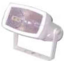
Metal halide 70w/150w Code: LE-08