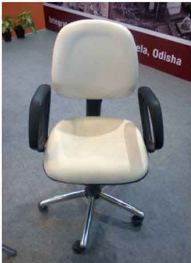
Executive Chair Code: CF-09 620(W)X500(D)X800(H)