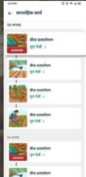
List of SOPs