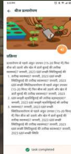
See Full Detail